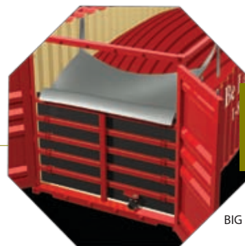
BIG Red Straight-bar Bulkhead™

A freight train can move a ton of single gallon of fuel - 4x as far a