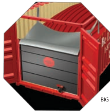
BIG Red Rigid Bulkhead™