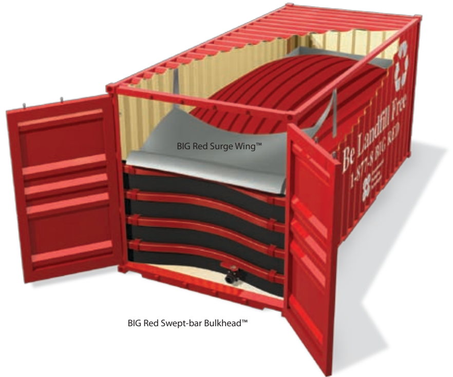
BIG Red Swept-bar Bulkhead™

EPT has designed two patented bulkhead systems totally unique to our industry. BIG Red Flexitank customers can ship their liquid cargo with confidence that it will arrive safely at its destination.