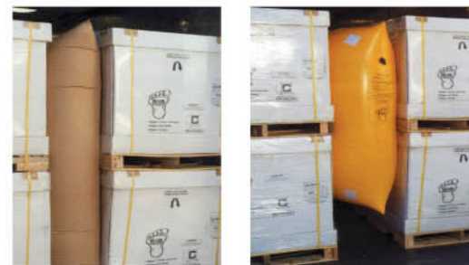
Available in different sizes.

Dunnage bags are inserted into void spaces inside containers, rail cars or trucks. Once inserted, they are inflated with compressed air to the recommended level. This inflation serves to gently push the load away from itself, wedging it against other pallets or the outside walls of the container. This creates a solid brace, stabilising the load and preventing any future movement, thus greatly reducing the risk of damage during transit.